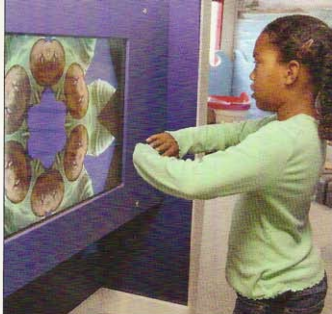
A computer screen makes an interactive, silly looking kaleidoscope of kids moving around.

castle-shaped blocks, a boat floating on a waterbed mat and a walk-through lighthouse. Little ones strengthen hand-eye coordination on the greens in the MY Go-Fore Golf exhibit, which features crawl-through gopher tunnels spotlighting underground animals.