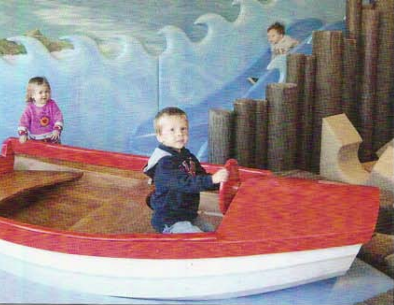
Little ones enjoy a water-filled surface to bounce on and a red boat to drive after a trip down the slide.